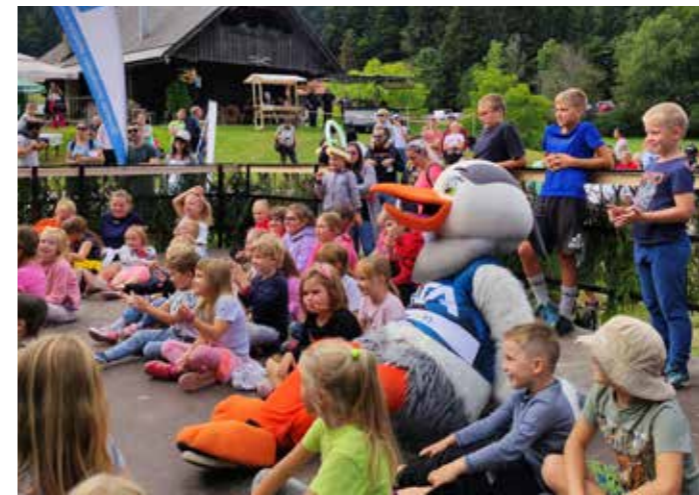
VITA AT LOCAL EVENT CLOSE TO BLED