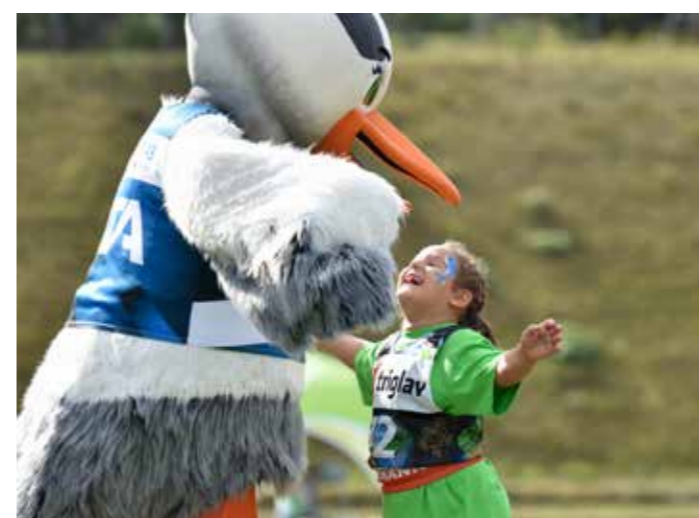
VITA AND CHILDREN WITH CHILDHOOD CANCER