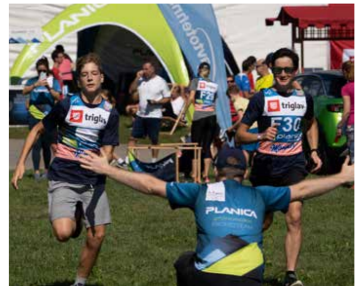
OUR TEAM AT ONE OF MANY RUNNING EVENTS IN SLOVENIA