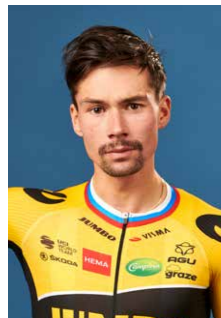
PRIMOŽ ROGLIČ

"Competing at the World Championships is a special privilege and reward for every athlete. Often it is a competition that you think about for a long time and prepare for. If I think about it, Slovenian athletes really do not have many opportunities to fight for such important medals on home soil, so I must admit that I envy our Nordic skiers quite a bit. I know that this brings additional pressure, which is not easy, but I want everyone to turn it to their advantage and that it gives them extra strength to achieve the best performance in their careers. I am already cheering for everyone, and I am looking forward to Planica finally hosting the World Championships in all its beauty!"