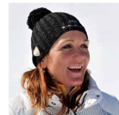
PETRA MAJDIČ

But there are definitely a lot more positive things about the fact that the World Championships is coming to Slovenia, and that is really good! I remember when we managed to bring the World Cup to Rogla after a long period of time, it was one of the more emotional moments in my career. Finally, you pay tribute to all those who support this sport, and you try to justify your work, upgrade it with the result, and this can be the icing on the cake of such an event. I wish our competitors in Planica a lot of relaxation, a big smile, to hover on the wings of the rise of Nordic sports in our country. Let them not put a lot of pressure on their shoulders, let them show what they show in training. If they impose the burden on themselves that this is the World Championships on home soil, not everyone can withstand such pressure. I wish for them many spectators, we will all be cheering for them! Let this be a fantastic World Championships for us, the fans and for those who will be competing!"