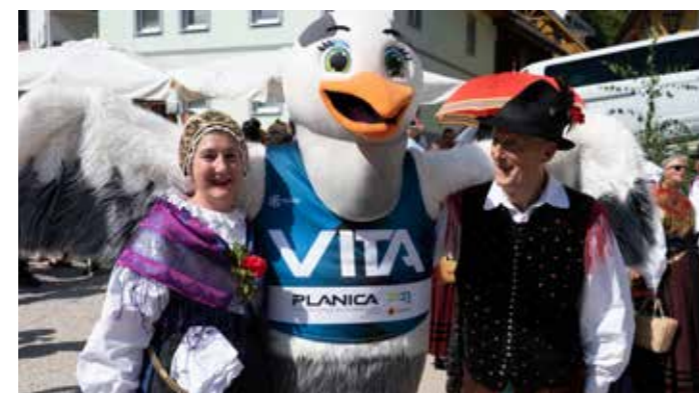
VITA AMONG THE PEOPLE OF RATEČE

In the immediate vicinity of Planica lies the village of Rateče, on a plateau below the tripoint of Slovenia, Austria and Italy. It is surrounded by the high peaks of the Julian Alps in the south and Karawanks in the north. Two alpine valleys branch off from Rateče. The first one is Planica, which ends in Tamar below Mount Jalovec, where the first spring of the river Sava Dolinka, the Nadiža waterfall, gushes out from under Ponce mountains. The second one leads to the Fusine lakes (also Mangart lakes or Belopeška lakes) and ends under the northern wall of Mount Mangart. A Rateče manuscript from the second half of the 14 th century was also discovered in Rateče. A visit to the village is a mandatory part of visiting Planica.