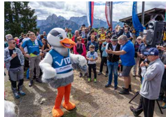
VITA AT TRIPOINT OF SLOVENIA, AUSTRIA AND ITALY PHOTO: TIN ŠTER