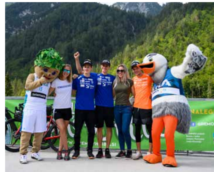
VITA AND SLOVENIAN SKI JUMPERS IN PLANICA