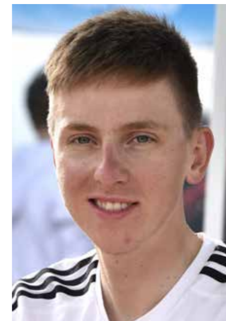
TADEJ POGAČAR

and having a competition of such a level as the World Championships on home soil is really something unique. If time allows, I will be happy to watch a competition, as it is my pleasure to watch the performances of our athletes. I hope that the championship, like the Tour of Slovenia, will bring a lot of good for Slovenia."