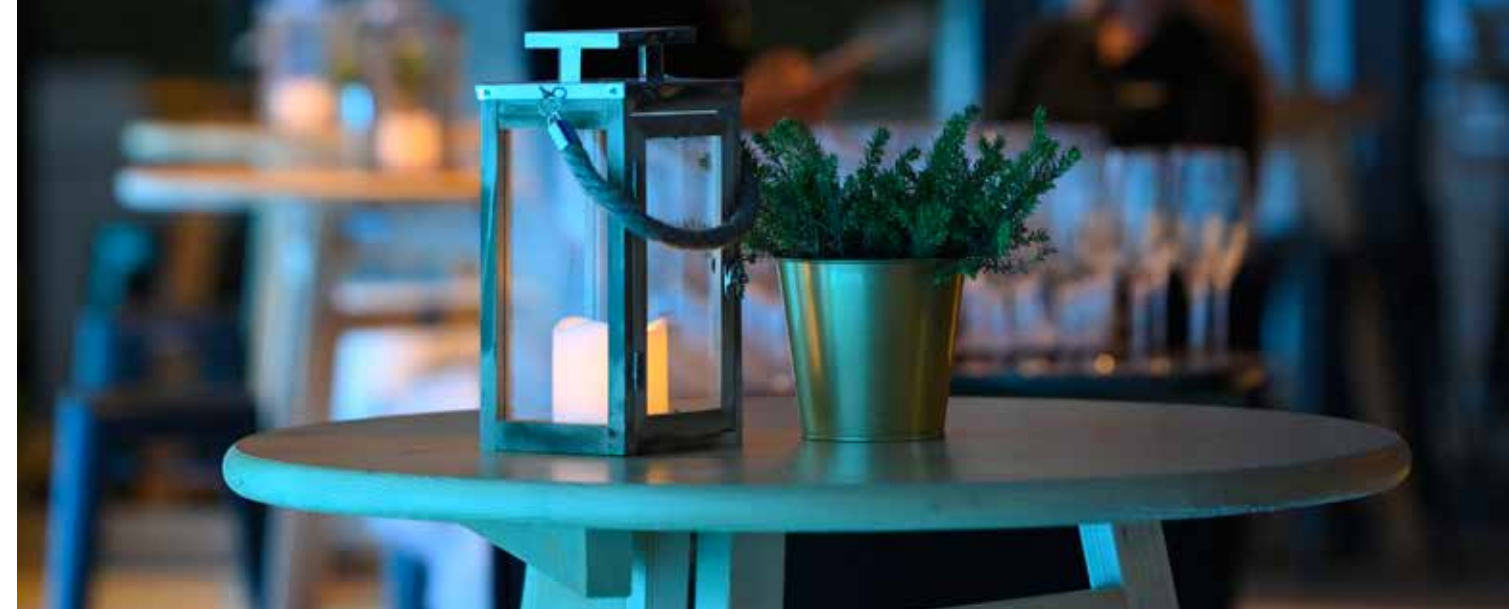
PLANICA WILL SHINE LIKE NEVER BEFORE