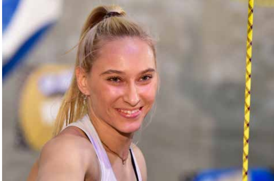
JANJA GARNBRET