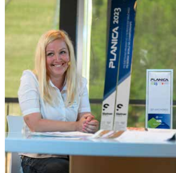
ANA DOLHAR PHOTO: OC PLANICA

Everything must fall into place, the essential factor is the height of the in-run, which the jury must choose correctly for the specific conditions, then the conditions themselves, and the jumper must succeed in an ideal jump, without faults, then a record is also possible.