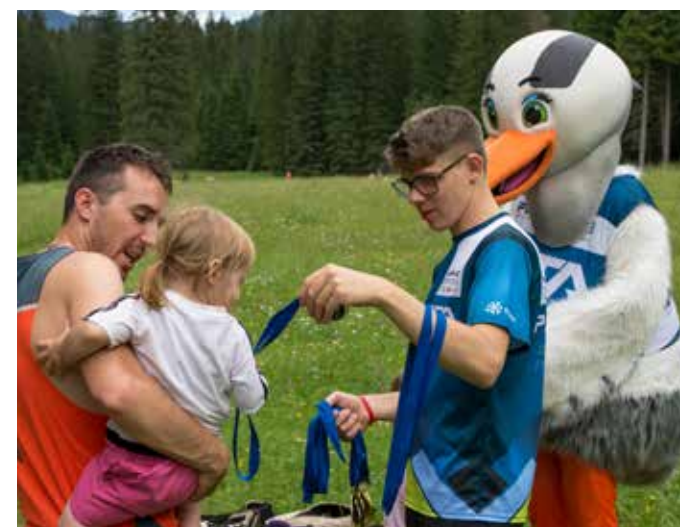
VITA IN TAMAR VALLEY

When we first met our Vita, it was love at first sight. We could only wish for her to become so popular. It is our job to keep her that way. Eventually, she will achieve that everyone will know her as a Planica heron. To this day, she has been many things, but no one can take away her name and cordiality. Vita is already fairly warmed up for the World Championships, and she will be even more warmed up by the upcoming events, which she is very happy to attend.