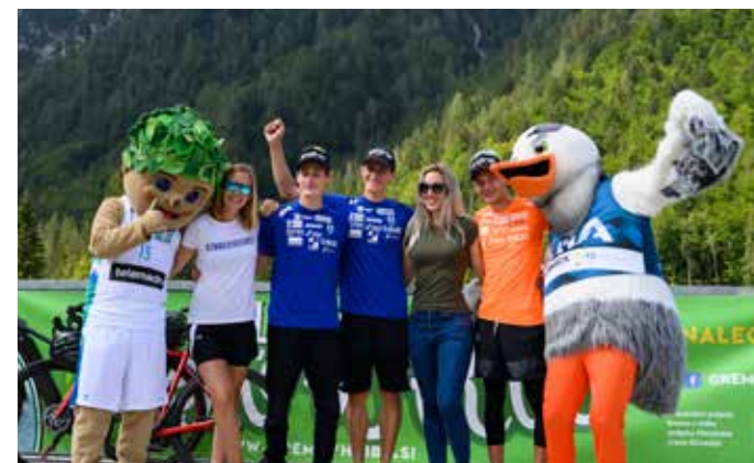
VITA WITH SLOVENIAN SKI JUMPERS IN PLANICA, PHOTO: URŠA MIŠMAŠ