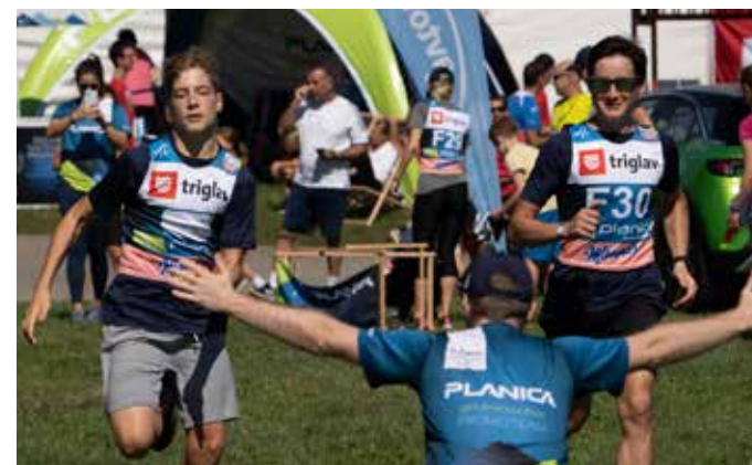
PROMO TEAM AT RUNNING EVENT IN KRANJ