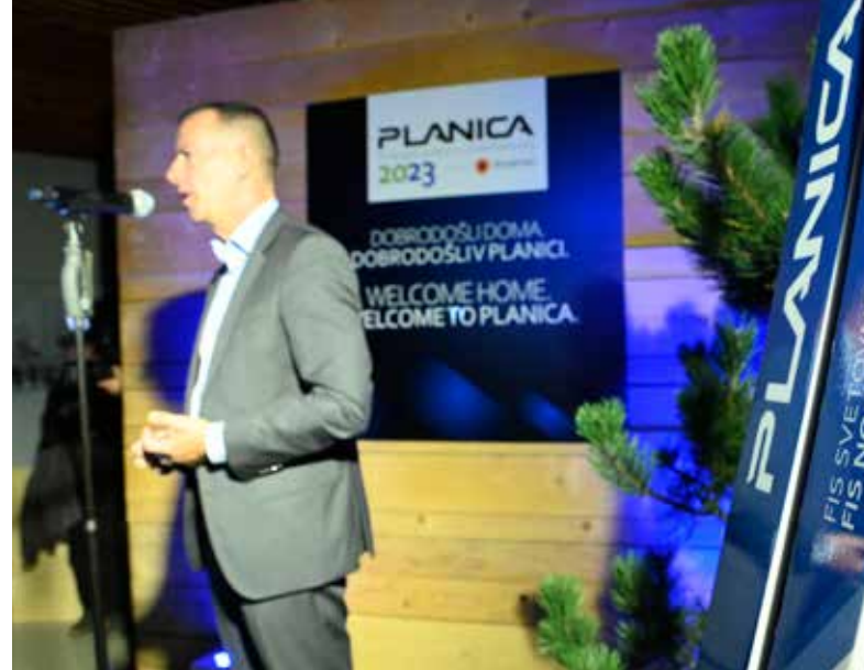
THE START OF MULTI-DAY TICKETS SALES