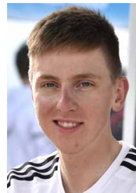
TADEJ POGAČAR

"I am convinced that the World Championships in Planica will once again be a true sports festival. I really enjoy competing on Slovenian roads