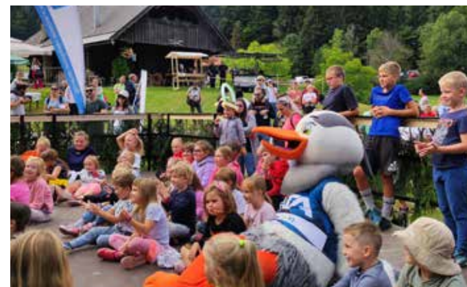
VITA AT LOCAL EVENT CLOSE TO BLED