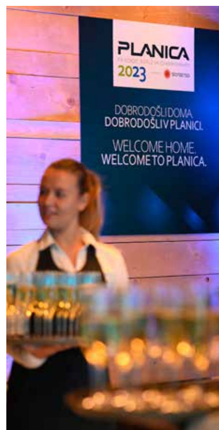
WELCOME HOME

The ticket prices range from 15 EUR to 64 EUR for regular tickets – standing. Fans will be able to watch at least two competitions per day, follow an accompanying music program, and take part in many events at different venues. A special spectacle is promised at the so-called Medal plaza in Planica Nordic Park in Kranjska Gora, where the medal ceremonies will be held, as well as the opening ceremony on February 21, 2023.