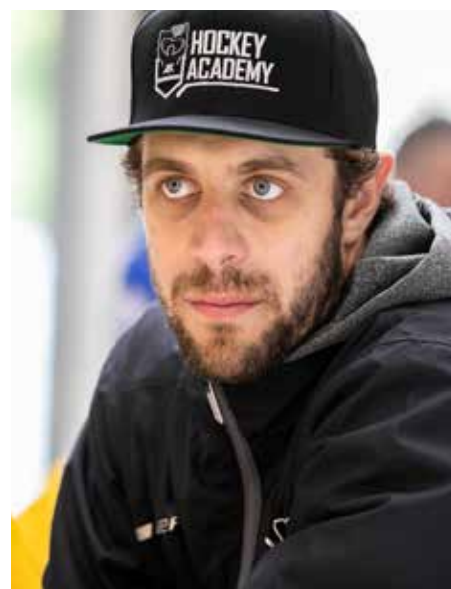
ANŽE KOPITAR

Anže Kopitar , two-time Stanley Cup winner with the Los Angeles Kings