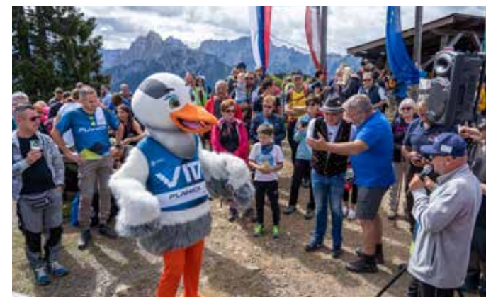
VITA AT TRIPOINT OF SLOVENIA, ITALA AND AUSTRIA, PHOTO: TIN ŠTER