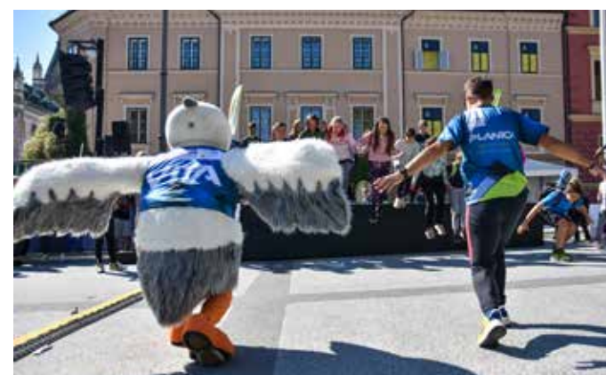
VITA AND OLYMPIC FESTIVAL IN LJUBLJANA