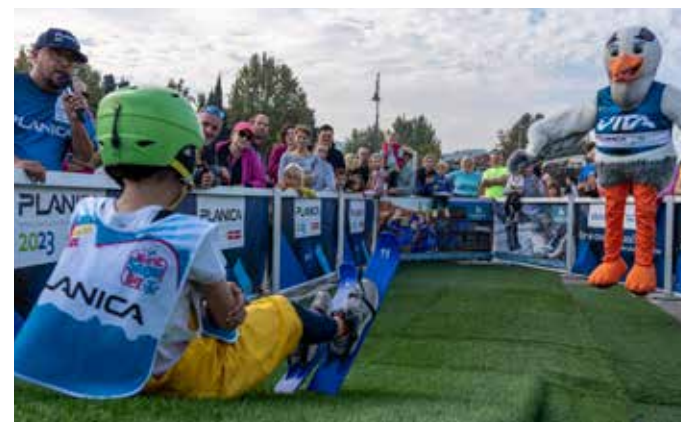
VITA AND MINI PLANICA COMMON EVENTS