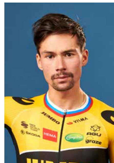
PRIMOŽ ROGLIČ

"Competing at the World Championships is a special privilege and reward for every athlete. Often it is a competition that you think about for a long time and prepare for. If I think about it, Slovenian athletes really do not have many opportunities to fight for such important medals on home soil, so I must admit that I envy our Nordic skiers quite a bit. I know that this brings additional pressure, which is not easy, but I want everyone to turn it to their advantage and that it gives them extra strength to achieve the best performance in their careers. I am already cheering for everyone, and I am looking forward to Planica finally hosting the World Championships in all its beauty!"