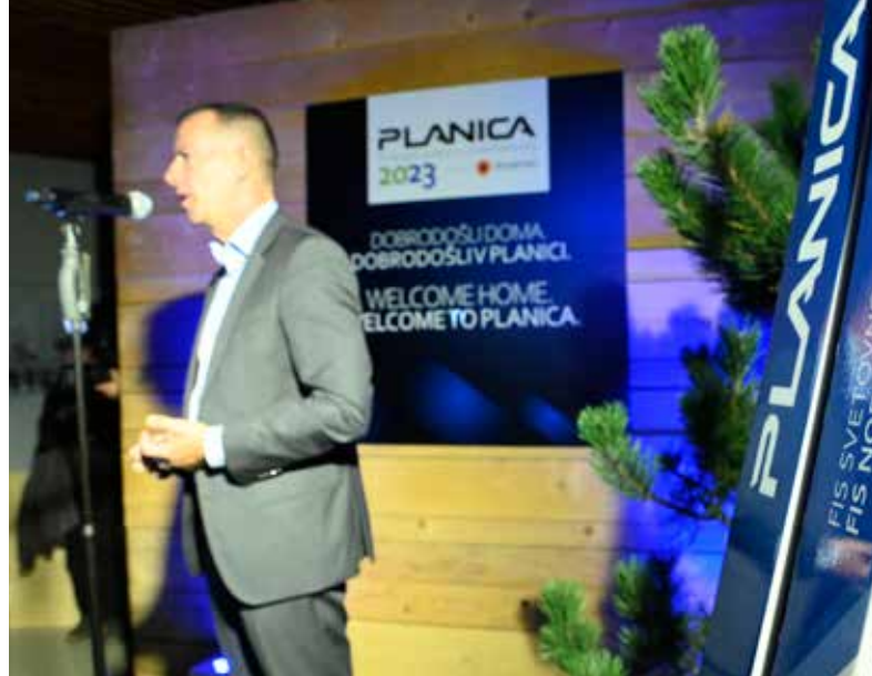
THE START OF MULTI-DAY TICKETS SALES