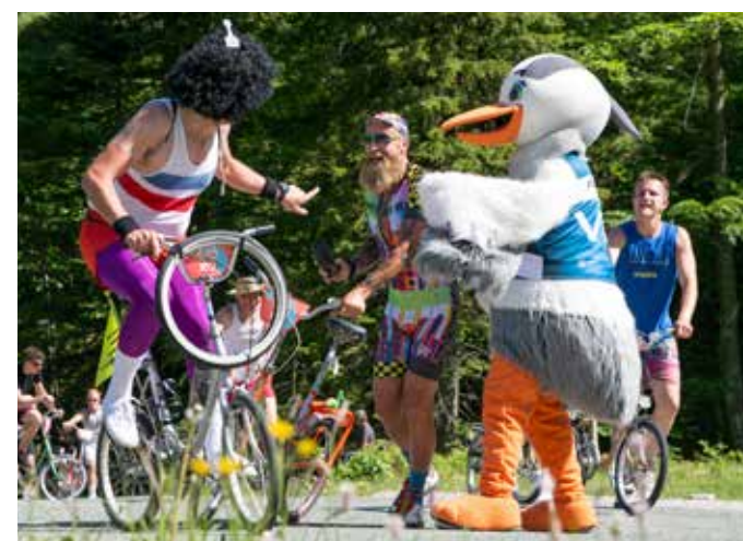
VITA AT AN EVENT "GONI PONY" IN KRANJSKA GORA , PHOTO: ALJAŽ PRISTOV