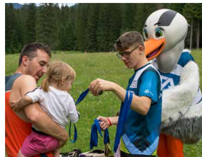
VITA IN TAMAR VALLEY

When we first met our Vita, it was love at first sight. We could only wish for her to become so popular. It is our job to keep her that way. Eventually, she will achieve that everyone will know her as a Planica heron. To this day, she has been many things, but no one can take away her name and cordiality. Vita is already fairly warmed up for the World Championships, and she will be even more warmed up by the upcoming events, which she is very happy to attend.